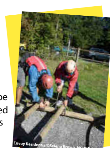
Envoy Residential

• Approximately 117,000 young people under the age of 21 will be paid less than the national minimum wage in 2009-10. • Over 60% of all 16-21 year olds work in low paying jobs, compared with just 30% of all other age groups. (Source: British Youth Council)