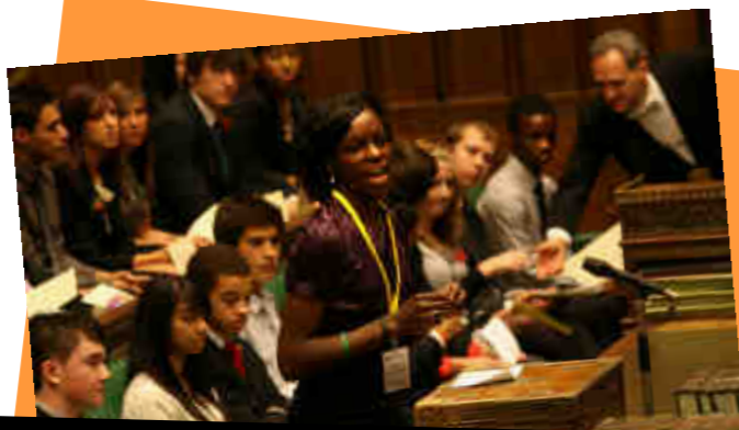
The UK Youth Parliament recently debated lowering the voting age to 16 in the House of Commons chamber”

friends without fear of being broken up by police for no reason.