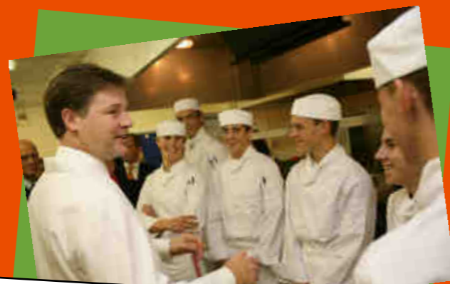
Nick Clegg at Bournemouth and Poole College

My background, where I come from, how I have been raised and my financial situation should not prevent me from achieving my full potential and chasing after all my goals; whether they be big or small, short or long term. Whatever my story or my means, there is no way I should lose out to anyone simply because they are from a more privileged background than I am. I'm glad the Lib Dems will ensure doors are kept wide open by.....cutting youth unemployment, abolishing fees for those taking their first degrees, providing more help for young people with families to realise their dreams, more apprenticeships/internships/and help with further studies.