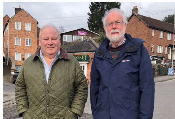
The winning team for Ashbourne

The Lib Dem Team across Ashbourne are united in their determination to represent residents' views and deliver improvements for the Town. Lib Dems will not sit quietly by when decisions are taken at Matlock that fail to take account of the needs of Ashbourne residents.