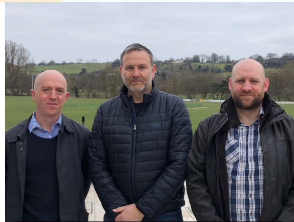
The winning team for Ashbourne

The Lib Dem Team across Ashbourne are united in their determination to represent residents' views and deliver improvements for the Town. Lib Dems will not sit quietly by when decisions are taken at Matlock that fail to take account of the needs of Ashbourne residents.