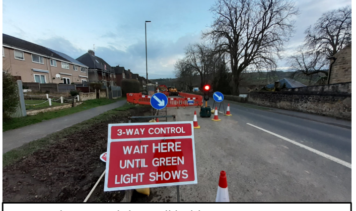
We need a Council that will hold Severn Trent to account for badly co-ordinated roadworks

Joined-up thinking, or same tired old Tories?