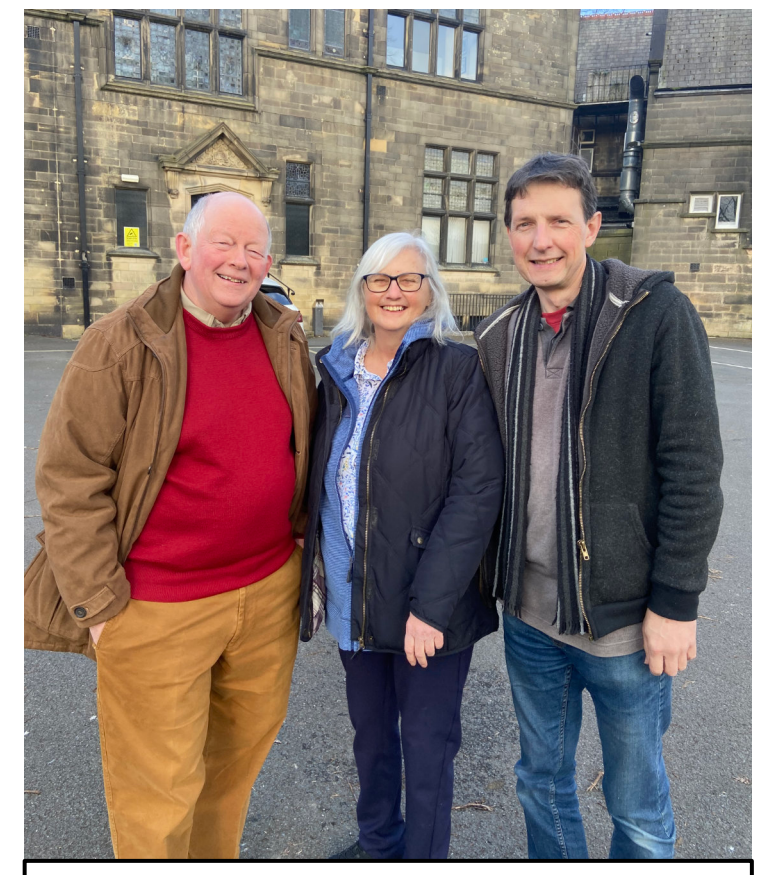
Darley Dale and Matlock are already taking more than their fair share of new housing. Liberal Democrat councillors will fight to ensure new targets are shared with the Peak Park, and built to carbon neutral standards.

After years of Tory neglect, it's time for a better deal for Darley Dale.