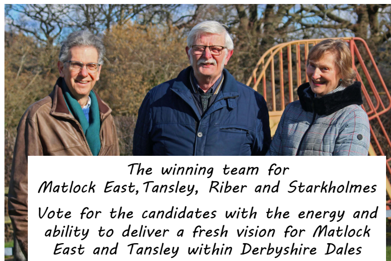
The winning team for Matlock East, Tansley, Riber and Starkholmes Vote for the candidates with the energy and ability to deliver a fresh vision for Matlock East and Tansley within Derbyshire Dales

We make sure that residents' needs and wants are taken into account in Council decision making.